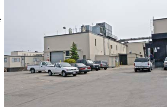
Central Refrigeration Plant

The information contained herein has either been given to us by the owner of the property or obtained from sources that we deem reliable. We have no reason to doubt its accuracy but we do not guarantee it. This information is subject to change and this offering can be withdrawn without notice